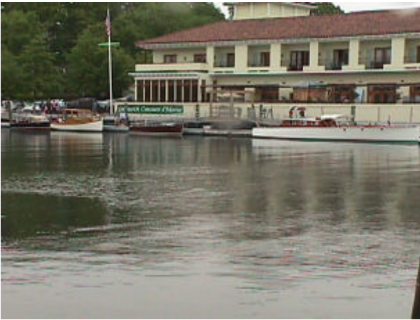
Pray-Group crew is seen cleaning and un-covering Malcolm Pray's Speedster.

Launches adorn the adjacent canal that forms one side of the Rogers Park peninsula. The Concours offers something for everyone, rich or poor, early boats, planes and cars from all decades are on display. The only missing link is Historic Hot Rods. If you have the opportunity to attend, come-on - down, take in the beautiful sites, cars and people.