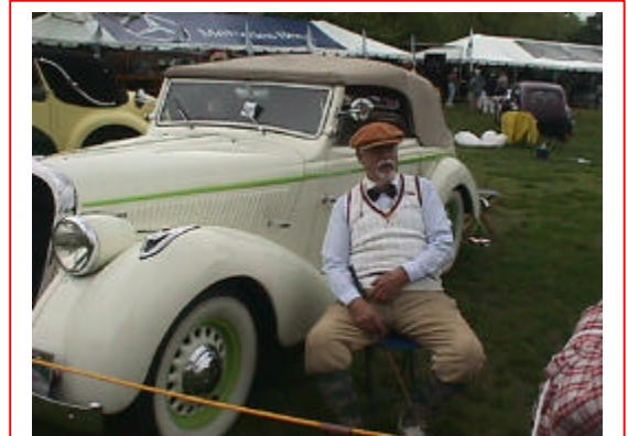
1939 Hotchkiss Grand Sport

I guess when a rare vehicle has your name; you can paint it to your personal taste. Attendees liked the Hotchkiss with its modern graphics. When a vehicle is that rare who would know its correct colors.