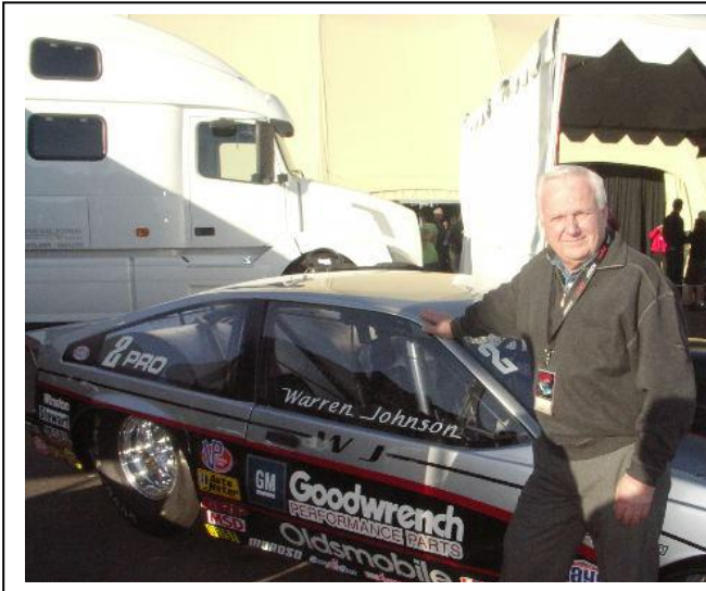
(Warren Johnson, Barrett Scottsdale 2008) Warren Johnson’s 1987 Ness Oldsmobile Firenza racecar, pictured above, sold for $99,000 at BJ Scottsdale 2008. Johnson, a legend in NHRA stock car racing, made history by breaking the 180mph, 190mph and 200mph speed barriers. This car was restored to its original condition by Johnson. Additionally, an international search team was formed to find a few of the missing original parts for the racecar. Some considered this model the most authentic NHRA Pro Stock car

Motors and Chrysler auction their latest performance vehicles at No Reserve and raise nearly $2 million for charities. The 2008 Ford Shelby GT500KR goes for $550,000, the 2009 Chevrolet Corvette ZR1 for $1 million and the 2008 Dodge Challenger for $400,000. Additional top sellers include the 1963 Pininfarina-bodied Chevrolet Corvette “Rondine” for $1.6 million and the 1963 Ford Thunderbird “Italien” for $600,000.