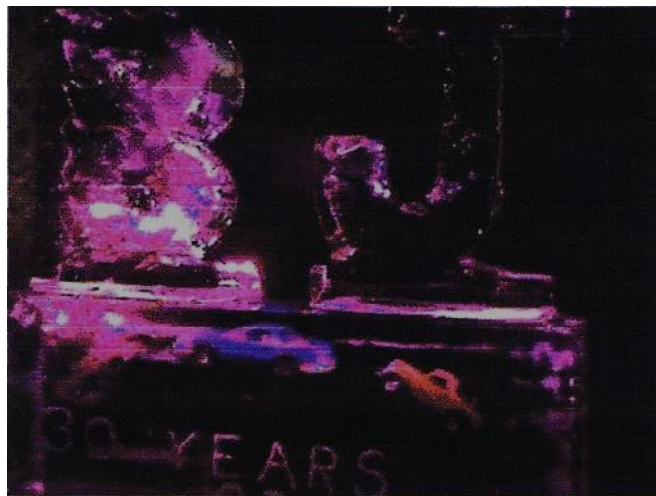
2001 Opening Gala had this unusual ice sculpture as a centerpiece.